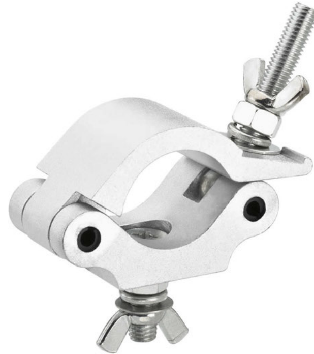
TA-100 Order No. 12.6760